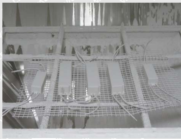
Photo 3 -- During the test of IPX7