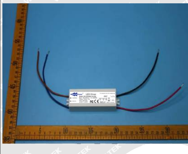
Photo 2 -- During the test of IP6X